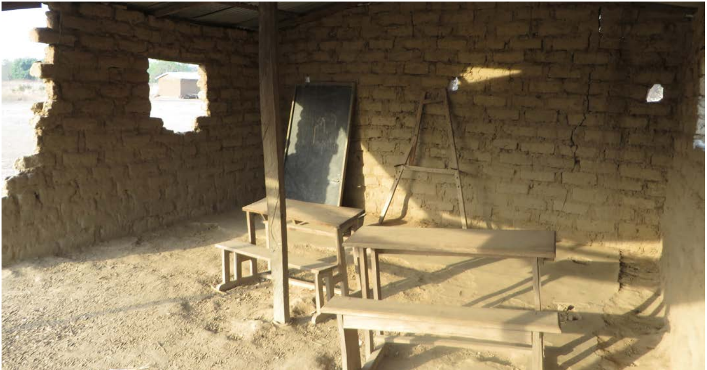
Photo: The current schoolhouse in Bromba, Mali

At the time of construction, Bromba had one government supported primary school, with 113 students (50 girls and 63 boys). Three teachers taught four grade levels in three temporary classrooms. Students walked as far as seven kilometers to another community with suitable classrooms for learning.